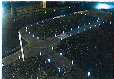
Right front at sanctuary entrance. This is only a snapshot of the 335 beautiful luminaries which lighted the church parking lot and grounds on Christmas Eve.